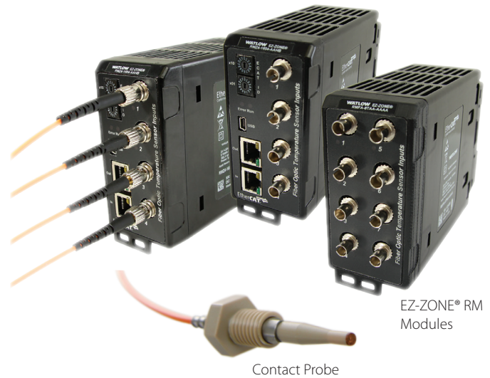
EZ-ZONE® RM Modules

The EZ-ZONE RMZ integrates fiber optics, PID temperature control and EtherCAT® communications into a single package. It features multi-channel control, hosting up to four channels of fiber optic inputs as well as supporting up to 30 additional control loops from other EZ-ZONE RM modules. These modules support a wide array of capabilities including I/O, logic, current measurement, power switching and more.