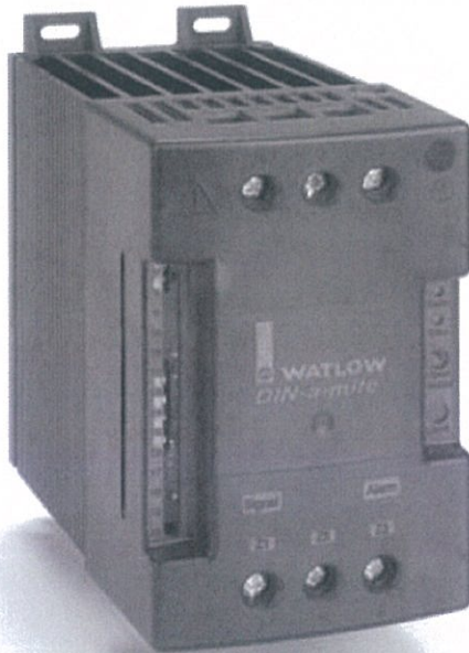
DIN-A-Mite C Natural Convection