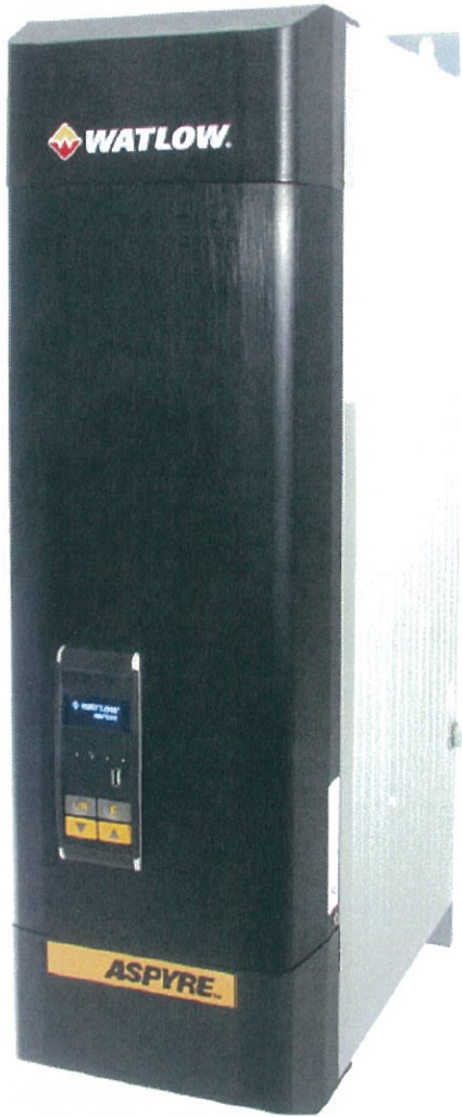
ASPYPE DT 300-800A Models Single Phase