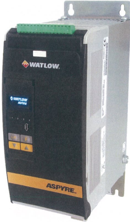
ASPYPE DT 60-210A One Phase unit