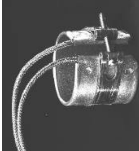
HV Nozzle with A Lead