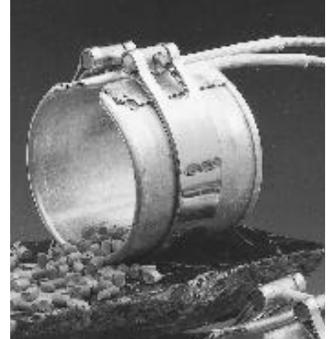
HV Nozzle with L Lead